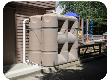
Cistern: temporarily store stormwater from your roof in above ground tanks.