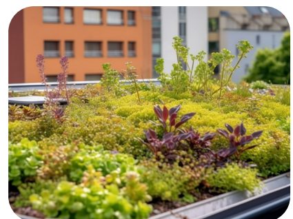
Green Roof: a vegetated roof system that captures and stores rainwater.