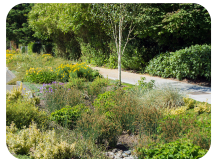
Rain Garden: temporarily stores and filters stormwater.